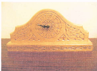
Jack Mc Adams Beautiful chip carved clock

Phil Drumm A rose is a rose is a rose unless Phil is carving it from a table leg—WOW!!